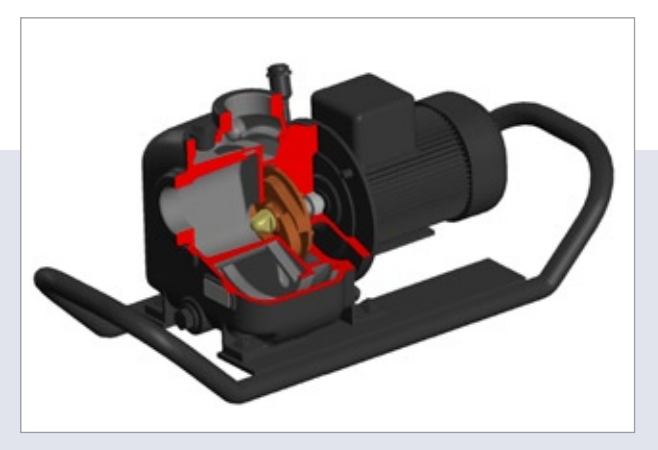
Info: 60 Hz variants with 3600 min -1 on requests