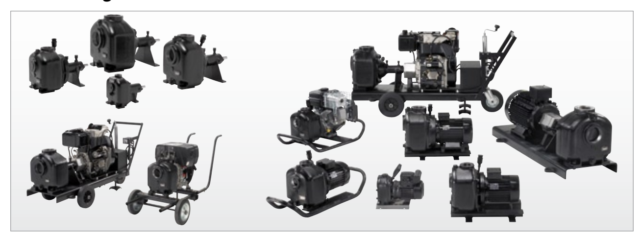
For stationary or mobile applications with carrying frame or trolley.